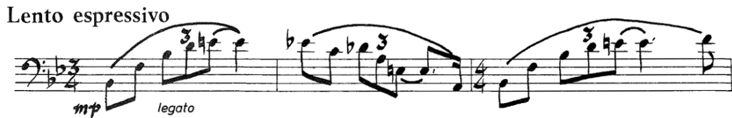
Figure 3. Filiatreault: Odyssée , measures 1-3.

Pedagogical/Performance Value: As both a composer and bass trombonist, Serge Filiatreault has written an excellent, very idiomatically well-written work for his instrument. Suitable for senior, graduate or professional recitals, this work features a variety of the bass trombone's distinctive characteristics within its short duration.