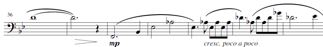
Figure 112. Bouchard: Prairie Desert , measures 36-42.

Technical Characteristics: Although the trombone part is rhythmically uncomplicated, it can initially be difficult to coordinate with the piano whose opening triplets (doh-sol-doh / sol-doh-sol) sound deceptively like 16 th notes. This pattern is followed by quintuplets, then six (in the right hand) against four (in the left hand), but the first note of each of these patterns is always the highest, which at least provides a strong foundational pulse. There are no large leaps in the trombone part, but many phrases are comprised of sequential fourths encompassing at least an octave, if not two (see Figure 112), so the performer must have enough flexibility to move seamlessly between registers.